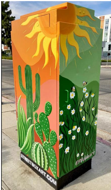
Samples of the Utility Box Art in Northridge, Chatsworth and Porter Ranch